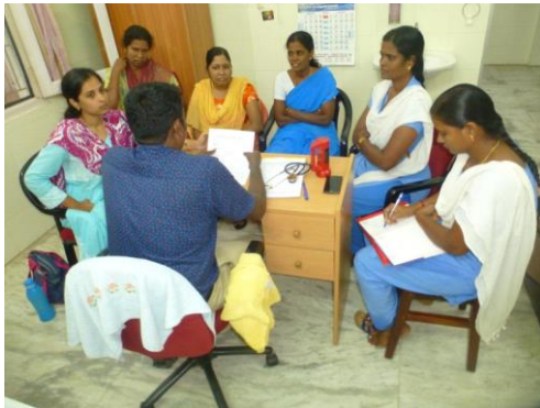
CLASS & TRAINING FOR NURSES

For snake bite cases patients are given first aid and then referred to government hospitals. Some people met with minor accident come to MHC for sewtcher and bandage of their wounds. Children with first degree burns are also given treatment. Patients with diabetics and with diabetic wounds are coming to MHC for treatment and for medical consultation.