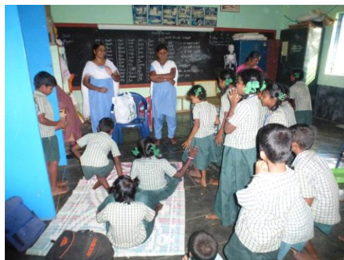
AWARENESS CLASS & NUTRITION CLASS FOR SCHOOL CHILDREN: