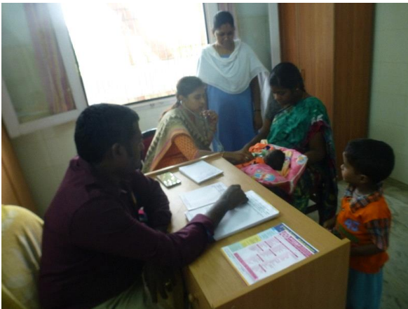
Blood test to find the haemoglobin(Hb)