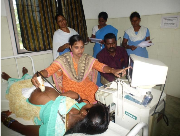
The presentation of the baby in the womb