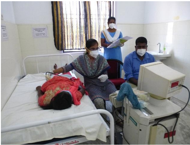
The presentation of the baby in the womb

A total of “0” Ultra sound scan and “119” checkups were conducted in MHC for pregnant women in this quarter. After the check-ups & ultra sound scan the pregnant women will be given the report of the check-ups. For anomaly scans and further consultations the pregnant women are sent to Dr.Gowri (Gynaecologist), Dr.Poomadhu and to Dr.Gomathi and to private scan centres. The ultra sound scan report contains the following,